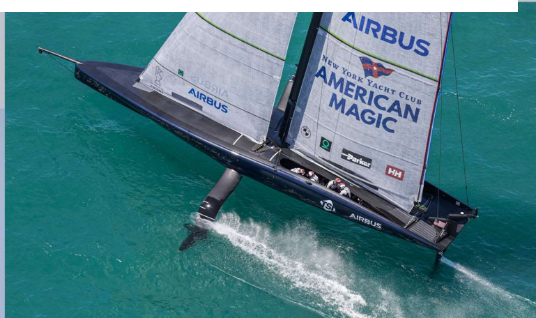
American Magic practicing on the day of the Christmas Cup.