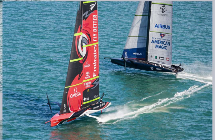
ETNZ and American Magic battle it out on the water.