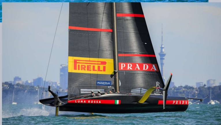
Luna Rossa Prada Pirelli, champions of the Prada Cup.