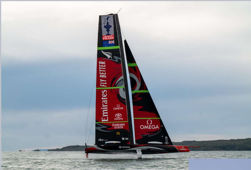
Te Aihe.