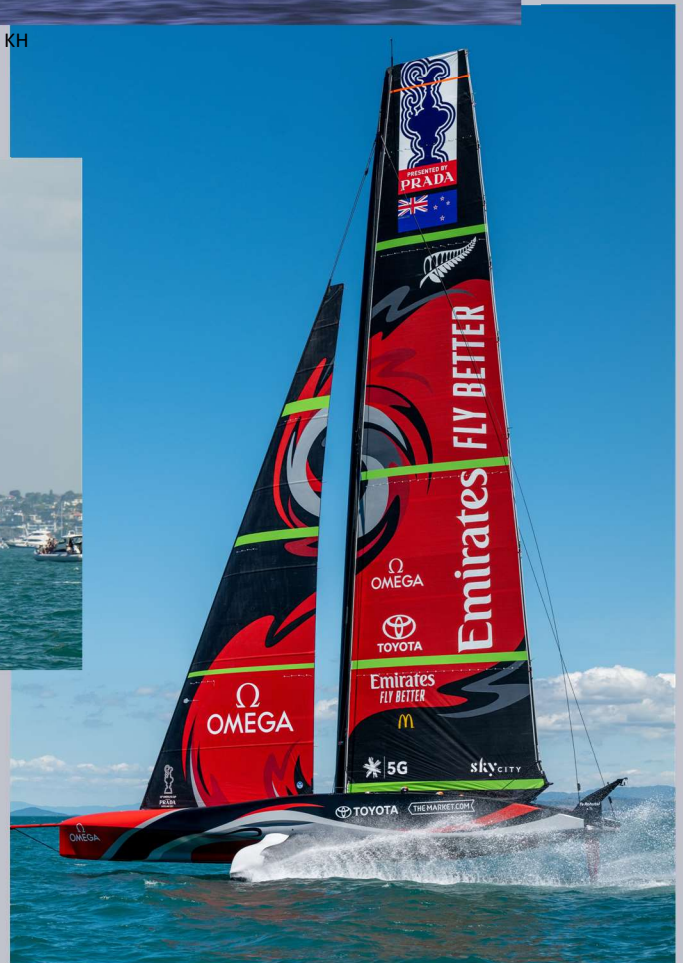
Te Rehutai training on the Hauraki Gulf.