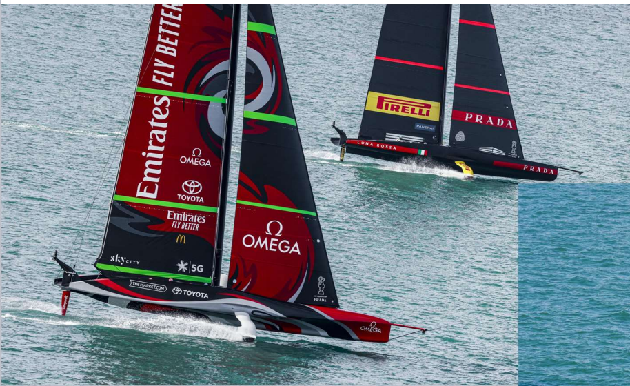
ETNZ and Luna Rossa during the ACWS.

The America's Cup World Series Auckland Races offered the 36 th America's Cup contenders their first opportunity in a competition setting onboard the AC75 yachts. After the COVID-19 pandemic in early 2020, all of the America's Cup World Series events had been cancelled, excluding the races in Auckland in December. Emirates Team New Zealand got off to a great start, with 5 wins and a single loss over the three-day event. American Magic came in a strong second with 4 wins and 2 losses, with Luna Rossa Prada Pirelli following in third with a split 3-3 and INEOS in last place with 6 losses. The World Series event gave the teams an opportunity to see how they performed against other yachts for the first time, and teams made adjustments as necessary in preparation for the Prada Cup.