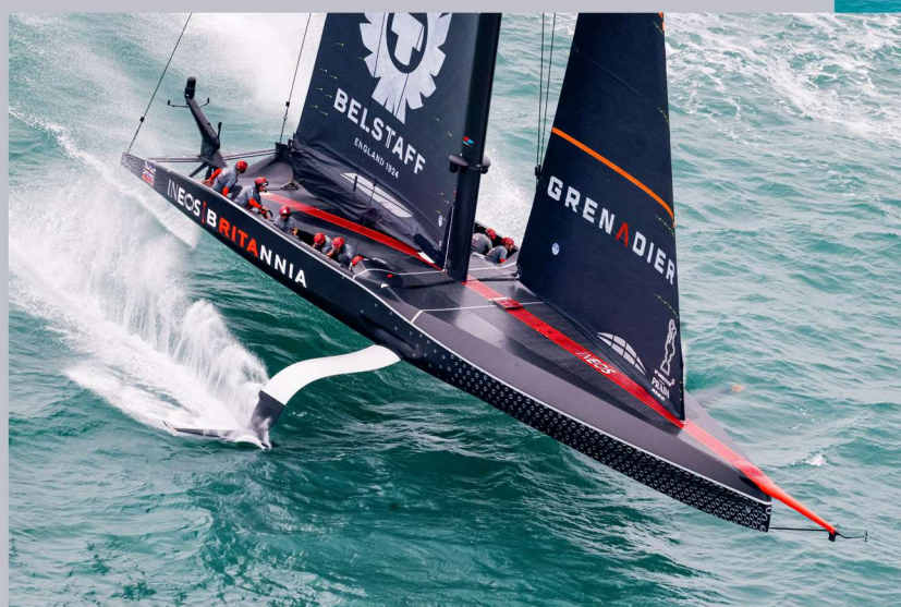
Britannia II during the Prada Cup finals.