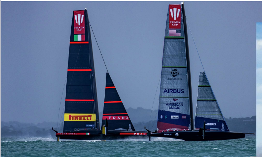
Luna Rossa and American Magic race prior to the capsizing.