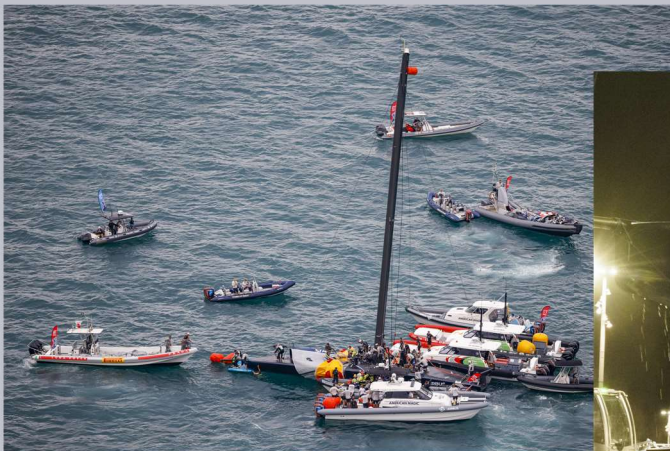
Chase boats assist Patriot after the capsizing.