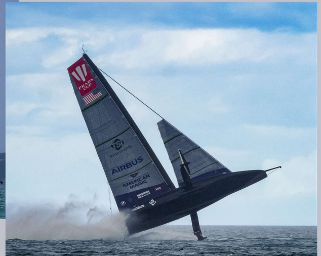
Patriot catching the gust of wind.