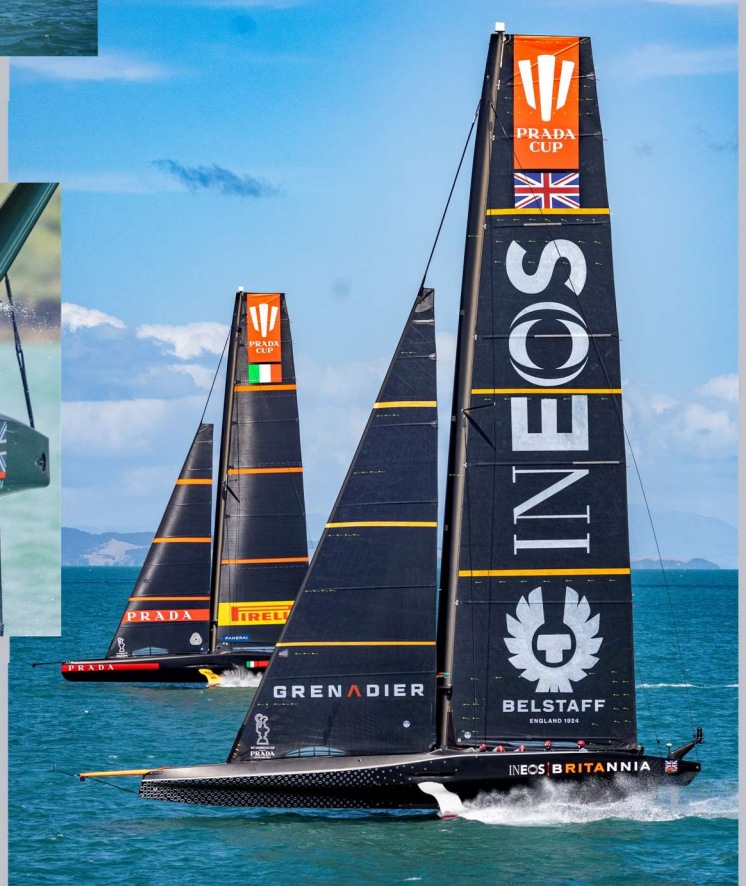
Britannia II and Luna Rossa 2.