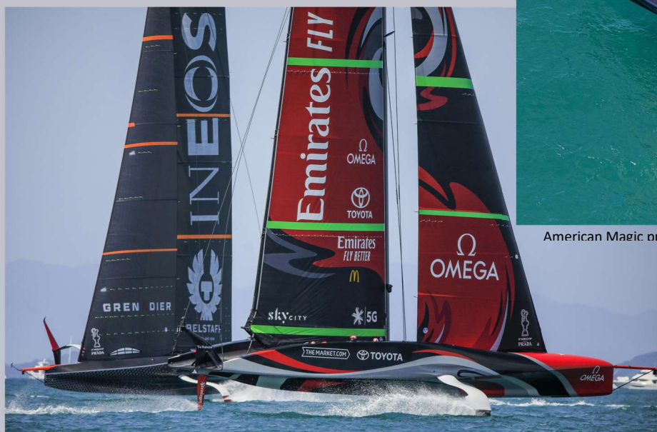
ETNZ and INEOS at the beginning of the Christmas Race.

Wind conditions for the Christmas Race were quite lacking. Race 1 was started, but terminated due to going over the time limit. In Race 1, ETNZ was able to get moving and quickly put some distance between themselves and INEOS Team UK. INEOS was unable to get their boat to any significant speed. Winds diminished throughout the race, and it was terminated after both boats were forced to sail in displacement mode. The three remaining races for the day were cancelled.