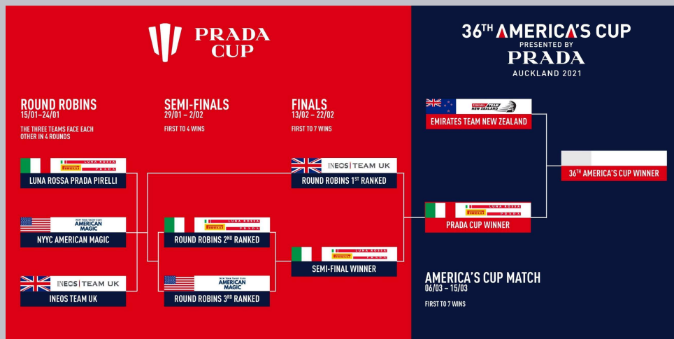
IMAGE: 36 th AMERICA'S CUP