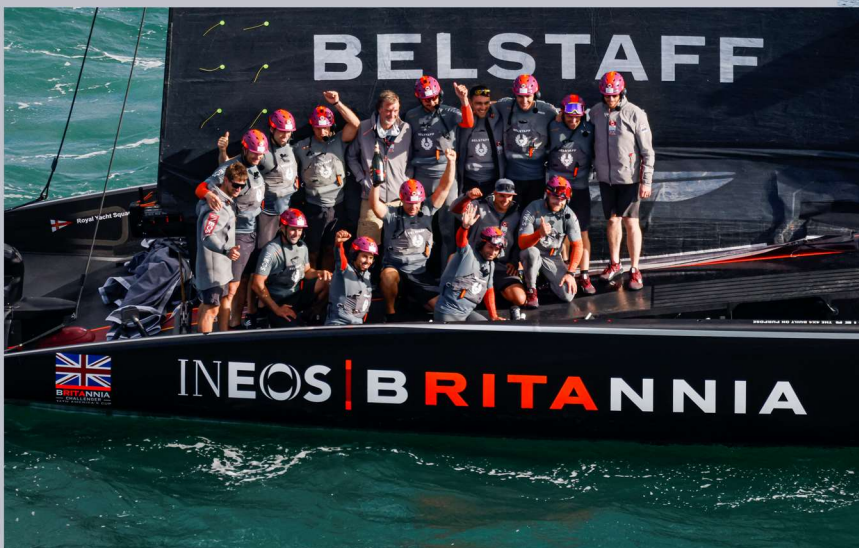
INEOS Team UK advances to the Prada Cup Finals.