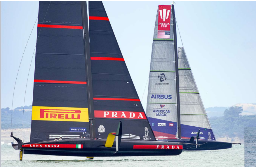
Luna Rossa and American Magic during the Round Robins.

How the tables have turned! INEOS Team UK made adjustments and came into the Prada Cup Round Robins very strong. They went from not winning a single race during the America's Cup World Series to going undefeated during the Prada Cup Round Robins, polar opposite of where they were at before. Just as in the ACWS, Luna Rossa Prada Pirelli split the Round Robins 3-3, and surprisingly, American Magic came in last place this time around, not winning anything. INEOS beat both teams three times each, and Luna Rossa beat American Magic once, and AM did not finish the other two races against Luna Rossa. INEOS Team UK was able to move on to the Prada Cup finals, sitting out the semi-finals while Luna Rossa Prada Pirelli and American Magic beat it out for the other spot in the Prada Cup finals.