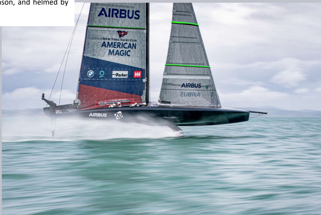
American Magic training on Patriot , November 2020.