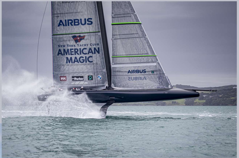
Defiant.