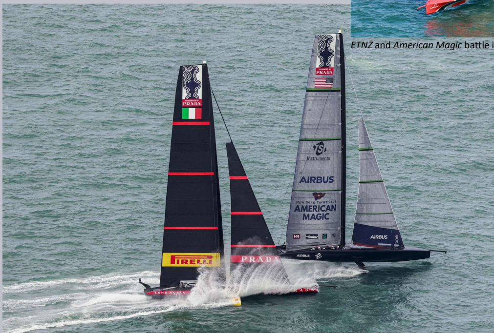
American Magic leads Luna Rossa in the ACWS.