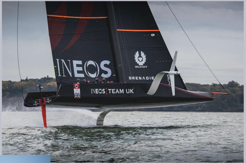
Britannia I.