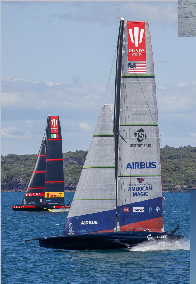
Patriot during the Prada Cup.

Team: American Magic USA Construction: Nov. 2019-Sep. 2020 Builder: AM USA, Bristol, Rhode Island, USA Lead Designer: Marcelino Botin Launched: October 16, 2020 Skipper: Terry Hutchinson Helmsman: Dean Barker Top Speed: 53.31 Knots