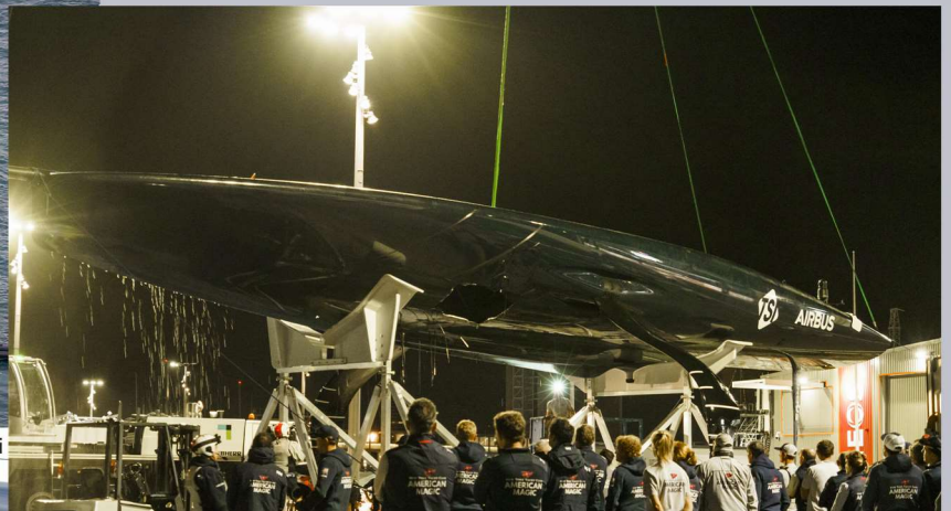
Patriot at the American Magic base after the capsizing. The hole in the hull is visible at center.