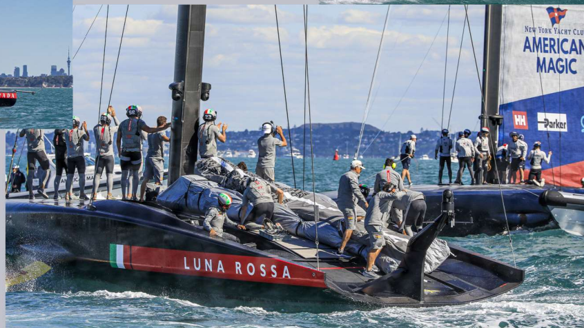
Luna Rossa Prada Pirelli, champions of the Prada Cup semifinals.