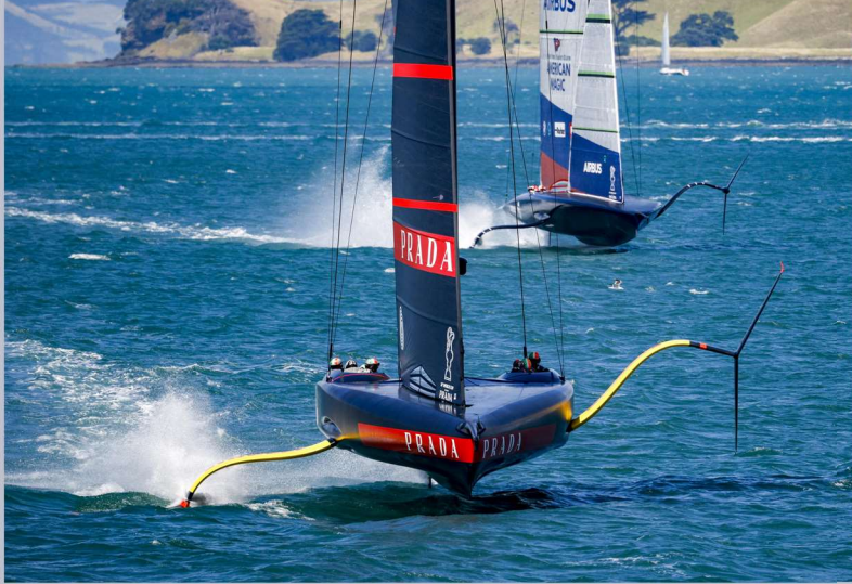
Luna Rossa leading American Magic in the semifinals.

Prada Cup Semifinals got underway a few days after American Magic returned Patriot to the water. This proved to be at their disadvantage, as they were having issues with the foil hydraulics and other systems during the semifinals races, and did not have time prior to get all of the bugs worked out after rebuilding the boat. Luna Rossa Prada Pirelli went on a four-race win-streak against American Magic, moving on to the Prada Cup finals against INEOS Team UK.