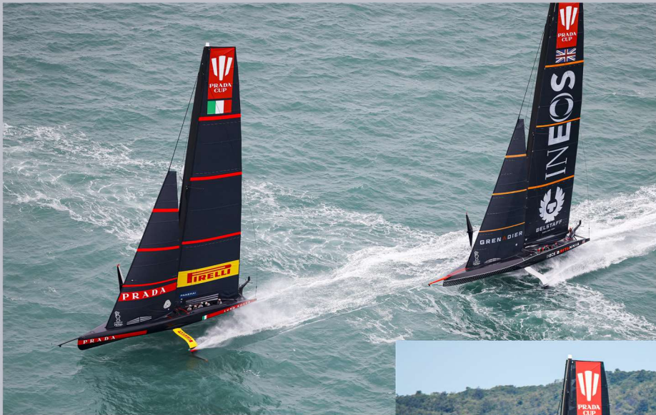
Luna Rossa with INEOS in pursuit.