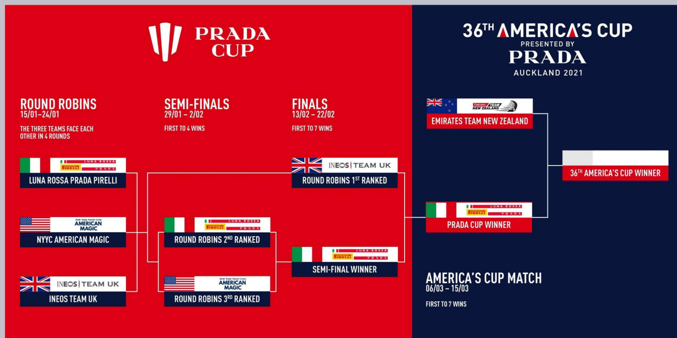
IMAGE: 36 TH AMERICA'S CUP