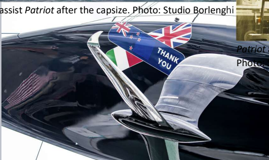
"Thank you" band-aid on Patriot.