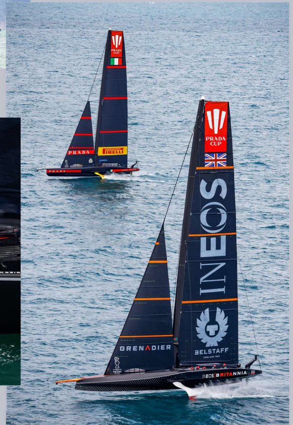
Luna Rossa and INEOS on the race course.